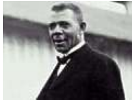
Booker T. Washington

TOPIC: What Character Traits Must Youth Develop to Become Emerging Leaders in the 21 st Century?