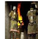
Firemen and Women