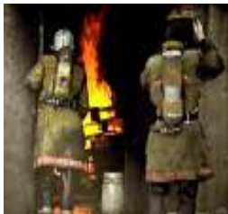
Firemen and Women