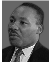
Dr. Martin L. King